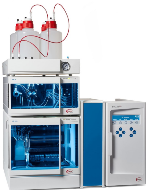
Figure 1: ALEXYS Carbohydrate Analyzer.

CO 2 present in the air can get easily dissolved in the mobile phase and form carbonate ions (CO 3 2- ). These carbonate ions interfere with carbohydrate retention on anion exchangers due to their strong binding properties as a divalent ion. This will lead to shorter retention times, decreased column selectivity, loss in resolution, and poor reproducibility. To minimize the introduction of carbonate ions in the mobile phase the eluents were carefully prepared manually using a commercially available carbonate-free 50% w/w NaOH solution. The diluent was DI water (resistivity >18 MΩ.cm), which was sparged with Nitrogen 5.0 (≥ 99.999% pure). During analysis, the ET210 eluent tray is used to pressurize the headspace of the mobile phase with inert Nitrogen gas (0.2–0.4 bar N 2 overpressure).